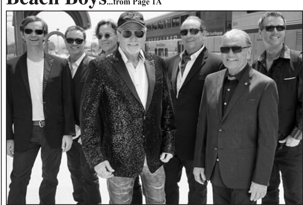
The Beach Boys

by an American Rock band), and four reaching No. 1 on the Billboard Hot 100.