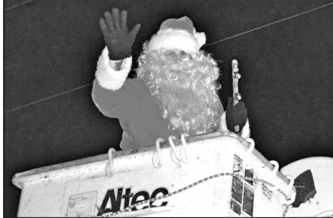
Who needs a sleigh when you've got a bucket truck, right, Santa?

So, to promote this cause, the entry fee into the parade is simple: bring an unwrapped